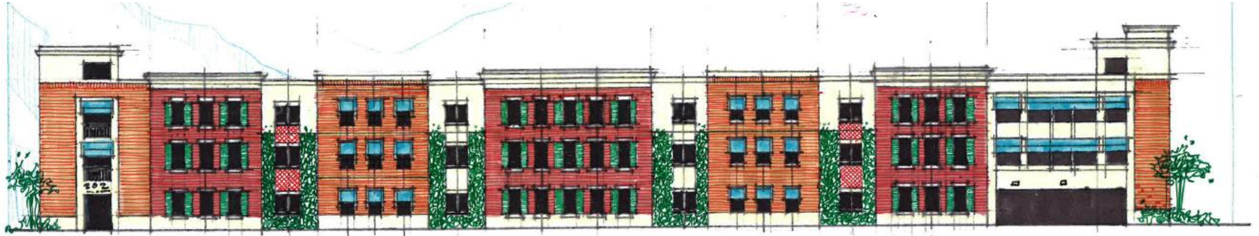
TOWN CENTER CONCEPT