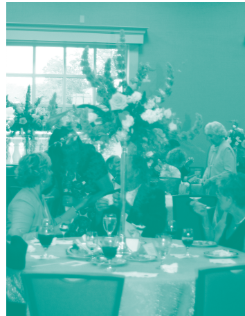
The Palmetto Terrace on the fourth floor of the Municipal Center offers banquet and event space and scenic views up Georgia Avenue, up and down North Augusta’s Riverfront and across the River.

Beyond the City Seal in the center of the four story Atrium is a set of steps that leads to the North Augusta Arts and Heritage Center . The Arts and Heritage Center houses displays representing North Augusta’s past and present, includes a gift shop, and is open to the public five days a week. For additional information on the Arts and Heritage Center, please visit http://artsandheritagecenter.com/ .