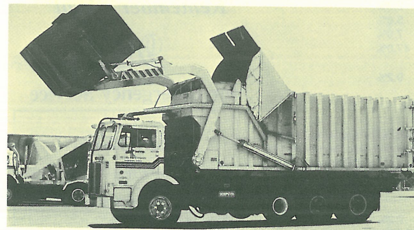
Front-end loading garbage trucks are safer and require less manpower to operate.

Anyone having questions concerning this new system should contact the Sanitation Department at 279-9453.