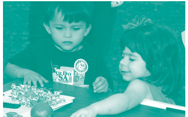
Classic photo from 2002 Kids Earth Day event

Kids Earth Day , on Saturday, April 14 from 10:00 a.m. to 2:00 p.m., will be held this year in Brick Pond Park. Earth Day is a nationwide celebration each spring intended to inspire awareness of and appreciation for the planet. North Augusta's event features dozens of exhibitors providing learning activities for children and information about plants, animals and the shared environment.