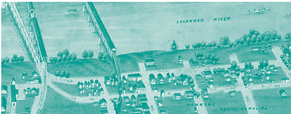
Aerial drawing of Hamburg, 1872.

The Arts and Heritage Center of North Augusta (AHCNA) is located on the first floor of the Municipal Center, 100 Georgia Avenue, in downtown North Augusta. Hours of operation are Monday through Friday, 10:00 a.m. to 4:00 p.m. and the first Saturday of each month from 11:00 a.m. to 3:00 p.m. The Center offers extended hours for special events and during the month of December. For more information, visit www.artsandheritagecenter.com or call 803-441-4380.