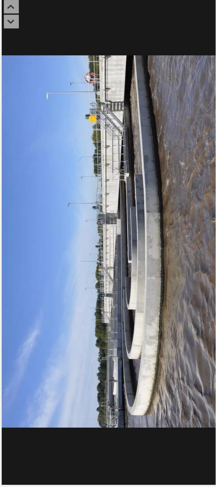
The Horse Creek Wastewater Treatment Plant is located along the Savannah River.