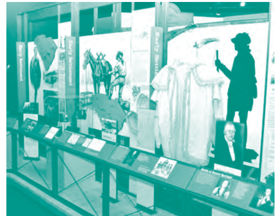
Exhibits detail the history and customs of rural South Carolina.

As part of its partnership with SCNHC, the Arts and Heritage Center of North Augusta will assume ownership of the regional history exhibits from the SCNHC's former Discovery Center in Blackville. By displaying these educational and technological exhibits which interpret the history of Aiken, Bamberg, Barnwell and Orangeburg counties, AHCNA serves as a gateway through which visitors will be introduced to the corridor, regional destinations and the region's character and history.