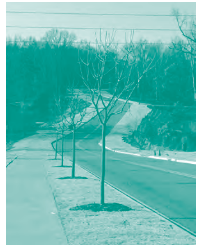
Newly planted street trees and native pond-side vegetation are a part of the Town Center Streetscaping project.

One of North Augusta's newest streets and two of its oldest are the beneficiaries of funding available to the City from the Transportation Enhancement Program. The North Augusta Town Center Streetscaping Project, a continuation of transportation improvements and beautification efforts in the downtown, provides for new landscaping and irrigation along Center Street, the 100 block of Bluff Avenue and the 200 block of West Avenue. The portion of Center Street through Brick Pond Park is being landscaped with native materials that will protect the pond environment and improve the appearance of the primary access to Hammond's Ferry. More than 100 trees of different varieties have been planted and are supported by sod, border grasses and irrigation systems. An added feature is the construction of a pond, stream and waterfalls along the Greenway Trail at Center Street.