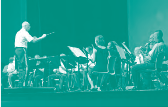
The Fort Gordon Signal Corps Concert Band closes out the 2010 Music in the Park season.

The North Augusta Cultural Arts Council kicks off its 2011 outdoor concert series, Music in the Park, on May 19. The free admission concerts, scheduled each Thursday through July 21 (except for July 7), begin at 7:00 p.m. and most are held at Maude Edenfield Park. In inclement weather, concerts move to the adjacent North Augusta Community Center. The final concert, on July 21, will be held at the Grace United Methodist Church Wesley Center.