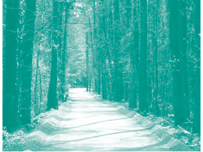
A twelve foot wide Greenway Trail extension from Pisgah Road north to Bergen Road will facilitate Trail access to city residents north of I-20.

The Greenway Trail is growing. Construction is underway this spring to extend the Greenway, the City's pedestrian and bicycle trail, from its current terminus at Pisgah Road approximately 1.25 miles along the former railroad right of way and under I-20 to Bergen Road. The extension will make it possible for City residents who live in the northern portion of the City to access the Greenway. The project includes landscaping with native vegetation and the creation of defined access points along the new length of the Trail. A new parking area for Greenway users will be constructed at the Bergen Road end of the project. The Greenway Extension project is consistent with the City's goal to provide additional Trail connections to neighborhoods, parks and schools. Future Greenway construction projects will extend the Greenway through Bergen Village and into Woodstone, Bergen Place, Bergen West and Wando Woodlands.