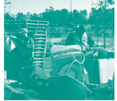
City employees and DHEC volunteers process electronic items collected for recycling

Area residents and property owners demonstrated a continued commitment to the environment at two recent events. On March 6, with strong community support, almost 800 electronic waste (e-waste) items were processed in a three hour period at the City's semi-annual Electronics Recycling Event. More than half of the items were computers or computer-related and the total weight of all items approached 13,000 pounds. The collection and processing effort was offered as a public service to participants and staffed by volunteers from the Aiken office of the SC Department of Health and Environmental Control (DHEC) and five City of North Augusta employees.