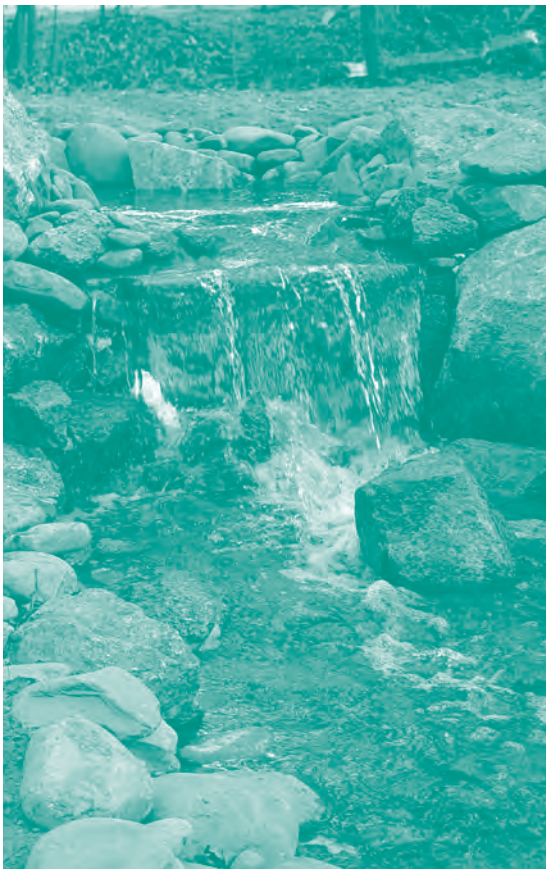
Waterfalls oxygenate stormwater runoff that enters Brick Pond Park

It is well known that Brick Pond Park, the thirty acre wetland and wildlife habitat located between the Greenway and the Savannah River, offers a unique outdoor experience to area residents. It provides walking trails and views of ponds, turtles, deer, fish, several species of birds, alligators and other wildlife. An important but lesser known fact about the Park is that it plays an important role in improving the quality of the City's stormwater before it enters the Savannah River. Constructed wetlands and waterfalls, specifically designed to filter and remove pollutants, treat stormwater runoff that drains into the Park. Planted and natural vegetation continues the filtering process by trapping sediment before it can reach the River.