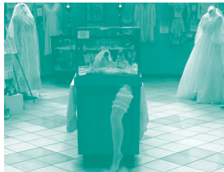
Wedding dresses from several decades are showcased in "Tying the Knot" at the Arts and Heritage Center.

Call 803-441-4380 or visit www.artsandheritagecenter.com for more information.