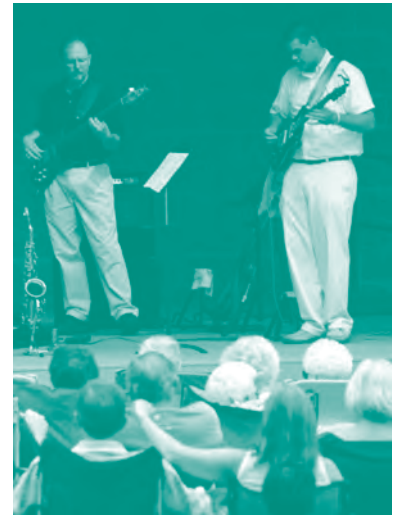
Concertgoers enjoy a 2009 event at The Verandah at Maude Edenfield Park.