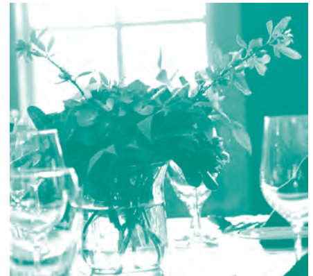
The Municipal Center's Palmetto Terrace offers elegant outdoor and indoor entertainment space.