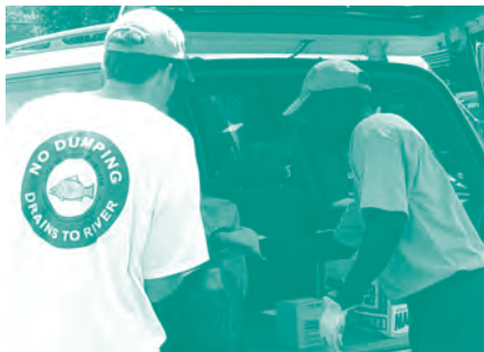
City of North Augusta employees remove hazardous waste materials for processing

The eighth annual Household Hazardous Waste Collection Event was held on Saturday, May 15. The purpose of the highly successful annual event is to provide area residents and property owners with a means to dispose of household hazardous waste materials, including paints and pesticides, in a manner that does not harm the environment. With the assistance of a qualified contractor, the City collects, separates and hauls all hazardous materials away for processing and proper disposal. The event is staffed by employees from several City departments and managed by the City's Stormwater Management Department.