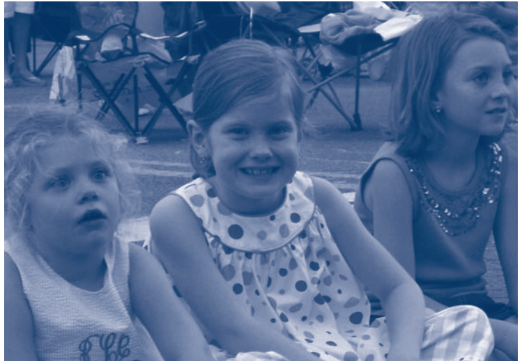
North Augustans of all ages enjoyed live music in 2008. This year's Festival features a performance by the Swingin' Medallions.

The Yellow Jessamine Festival is sponsored by the City of North Augusta in partnership with the North Augusta Cultural Arts Council, NBC Augusta, Episcopal Day School, Phoenix Commercial Printers, Coca-Cola, Georgialina Physical Therapy and the North Augusta Chamber of Commerce.