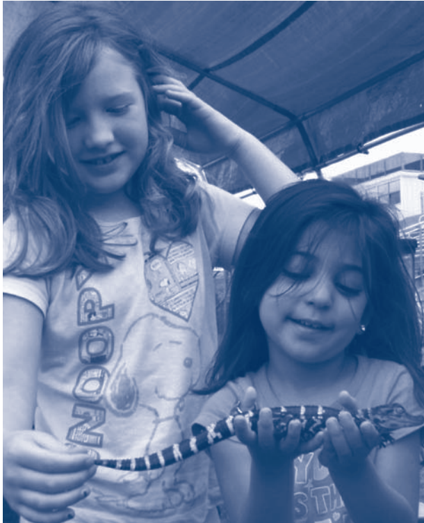
The Savannah River Ecology Lab's annual Earth Day presentation offers the opportunity for children to learn more about animals and their habitats.