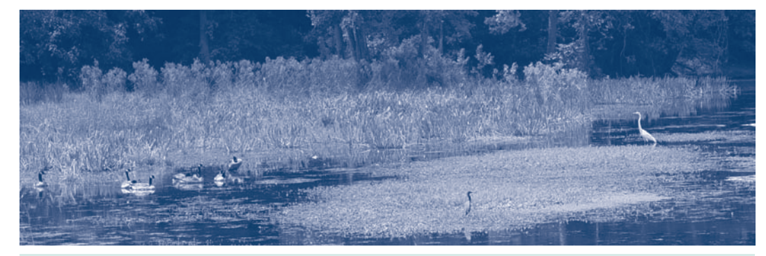
More than 75 different bird species have been spotted in the City's brick pond area this year.