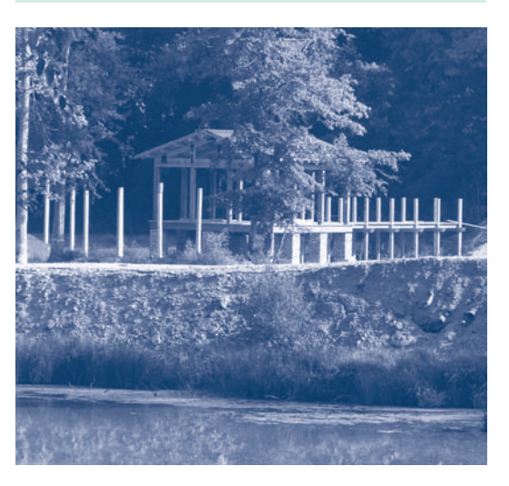
The completed pavilion (under construction in this photo) provides an opportunity to view the natural beauty of Brick Pond Park.

The initial goal of the restoration project was to improve water quality. Brick Pond Park will now be a place where wildlife can thrive and North Augusta citizens and visitors can learn about nature, wildlife protection, water quality and the history of the City.