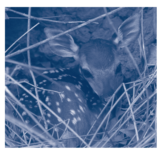
The uplands area of Brick Pond Park will remain undeveloped to preserve a natural habitat for area wildlife.

manufacturing industries that thrived there. Over the years the abandoned ponds became stagnant and overgrown with exotic (nonnative) vegetation. The construction of the wetlands included the removal of debris, fallen trees and waste bricks. Water quality has been significantly improved to support aquatic wildlife. The City, its partners, including Hammond's Ferry, and community volunteers worked to connect isolated ponds, remove the exotic vegetation, wetland species and create streams and waterfalls. The ponds will be accessible to the public over crushed brick nature trails that wind through the park on boardwalks and past babbling waterfalls to a viewing pavilion. Information stations located throughout the park describe the wildlife and natural wetland processes. A portion of the uplands area of the park will be left in a