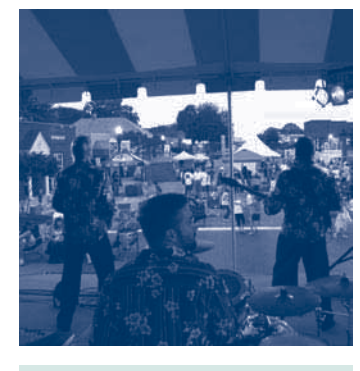
Riptide entertains the crowd.

Despite the threat of scattered thundershowers, North Augusta's second annual Yellow Jasmine Festival was a rousing success. Festival highlights included an exhibit and sale of entries in the Yellow Jasmine Art Competition, a garden expo with vendors, displays and professional speakers, vendors of fine art and handmade crafts, free children's rides and activities, and an evening street party followed by a beautiful fireworks display over historic Lookaway Hall.