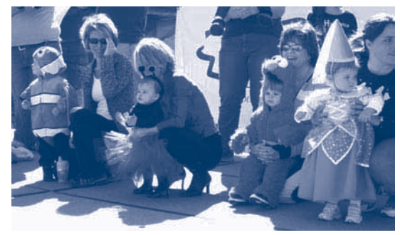
The children's costume contest is always a big hit at the Jack-O-Lantern Jubilee.

Listen to ghost stories around the campfire on Saturday, October 27, from 7:00 - 9:00 p.m. at the Living History Park. Presented by the Olde Towne Preservation Association.