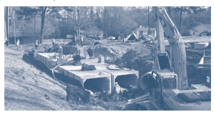
Construction is underway on the Buena Vista Avenue regional drainage system near the municipal building.

The $1.8 million project is being funded with $1.5 million from the Aiken County Capital Projects Sales Tax I fund and $300,000 from the city's Stormwater Fund. Construction is expected to continue through the end of June with periodic road closures affecting traffic between Georgia Avenue and Atomic Road.