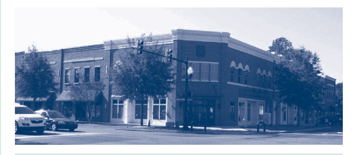
Jackson Square on the corner of Georgia Avenue and Buena Vista Avenue is currently 80% leased.

Developers, tenants and city officials celebrated the long-awaited grand opening of Jackson Square in September. The ribbon cutting ceremony was attended by more than one hundred people. Located at the intersection of Georgia and Buena Vista Avenues, Jackson Square offers a combination of retail and office spaces. Current tenants, several of whom are new to North Augusta, include Southern Bank and Trust, Blanchard and Calhoun, Anytime Fitness, Family First Mortgage and Eye Care One.