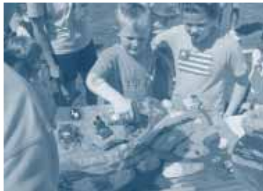
Learning about stormwater and its effects on the environment is just one of many hands-on activities at Kids Earth Day.

Saturday, April 15 will be a fun and educational day for the youth of North Augusta. At 10:00 a.m., the Easter Bunny will be the guest of honor at the annual Easter Egg Hunt sponsored by the North Augusta Optimist Club and the North Augusta Department of Parks, Recreation and Leisure Services. Usually held at Lions Memorial Field, this year's hunt will be held at Riverview Park and, as always, is free for children 10 and under.