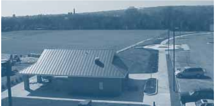
Hammond's Ferry Soccer Complex is in the final stages of construction.

Construction of the Hammond's Ferry Soccer Complex is near completion. The new soccer complex, located across Hammond's Ferry Road from the water treatment plant, includes one regulation size and two junior soccer fields, a covered picnic pavilion, restrooms and parking. As part of the project, Hammond's Ferry Road was widened to include a center turning lane, medians, curb, gutter and sidewalks.