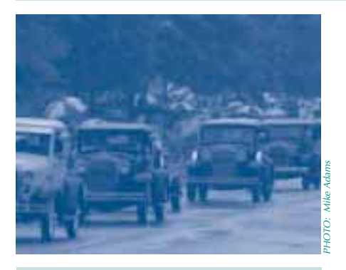
The Shade Tree "A"s weathered the storm with hundreds of dedicated onlookers for the centennial parade on April 22.