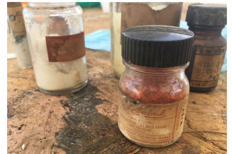
Annual Hazardous Waste Collection Event rids city of potentially toxic chemicals

activities, please visit the City of North Augusta's website www.northaugusta.net . Click on Departments/Engineering/Stormwater .