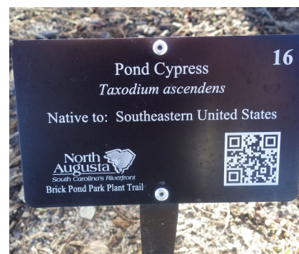
Test your QR Code reader now!

For a map of our new trail please see the North Augusta Stormwater Department Website.