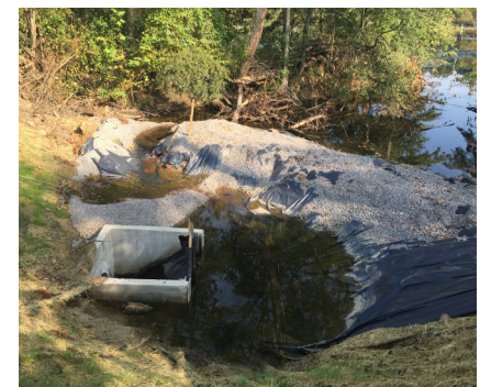
Brick Pond Park overflow installed near Railroad Avenue

Ultimately, the Savannah River will receive much cleaner water and the park will thrive.