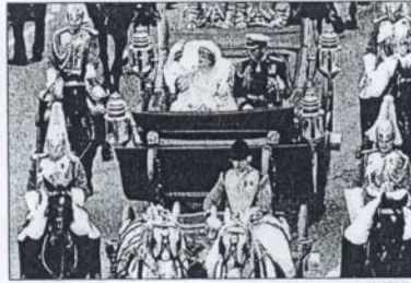
This is a July 29, 1981 file photo of the carriage carrying the Prince and Princess of Wales on its way from St. Paul's Cathedral to Buckingham Palace after the royal wedding in London. Thirty-six years after Lady Diana Spencer married Prince Charles, The Associated Press has restored original footage from the wedding and is making it available to the public on YouTube.

"They are very glamorous, but presumably, they don't automatically continue," he said. "Whereas with the royal family, there is always this expectation that you're always going to have this new generation, and now the attention has shifted to Will and Kate."