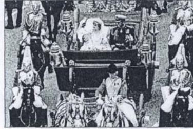
This is a July 29, 1981 file photo of the carriage carrying the Prince and Princess of Wales on its way from St. Paul's Cathedral to Buckingham Palace after the royal wedding in London. Thirty-six years after Lady Diana Spencer married Prince Charles, The Associated Press has restored original footage from the wedding and is making it available to the public on YouTube.

"They are very glamorous, but presumably, they don't automatically continue," he said. "Whereas with the royal family, there is always this expectation that you're always going to have this new generation, and now the attention has shifted to Will and Kate."